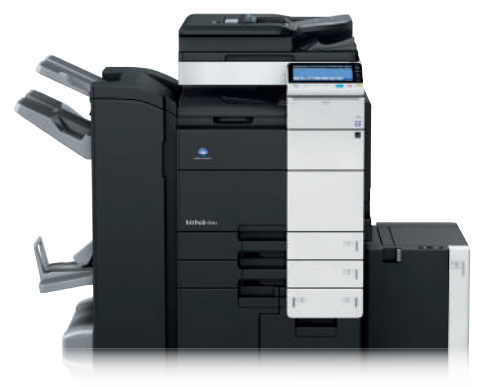
Fast, high-quality B&W printing and color scanning.

INFO-Palette design incorporates greater convenience for every employee and enhanced panel operation supports new tablet-like gesture operations for navigation. You can drag, drop, pinch in and pinch out, rotate images and bring up any menu you want with a quick flick of your finger across the screen.